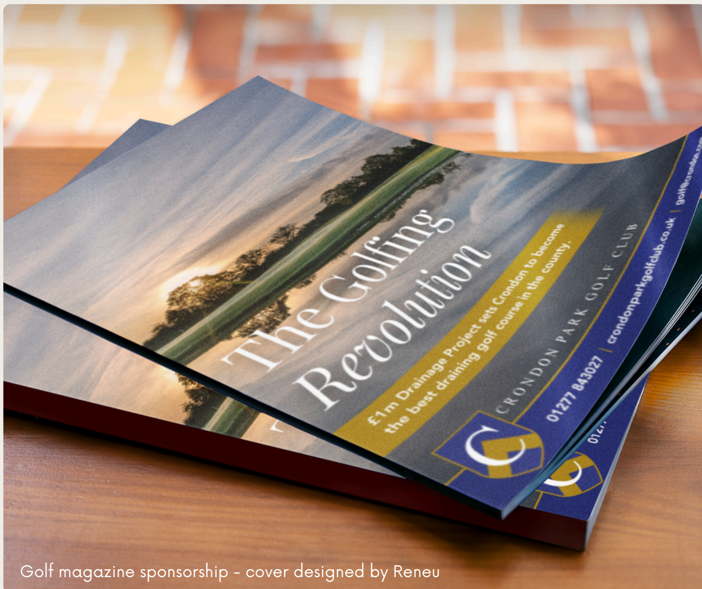
Golf magazine sponsorship - cover designed by Reneu